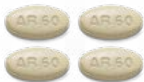
Tablets shown are actual size.

ERLEADA® is indicated for the treatment of metastatic castration-sensitive prostate cancer (mCSPC) or for the treatment of non-metastatic castration-resistant prostate cancer (nmCRPC).